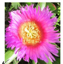
Figure 9: Flora species observed during August are as follows from left to right – 1) Gladiolus carinatus 2) Oxalis obtusa 3) Wurmbea stricta 4) Corycium orobanchoides 5) Romulea tabularis 6) Carpobrotus acinaciformis