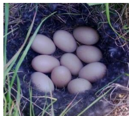
Figure 2: Cape Shoveler nest