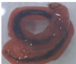
Figure 6: Chironomidae midge