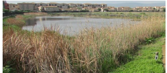
Figure 13: Fixed point photography of Wetland 2 on 18 August.