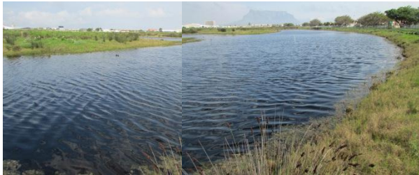
Figure 12: Fixed point photography of Wetland 1 on 18 August.