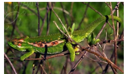
Figure 4: Cape dwarf chameleon