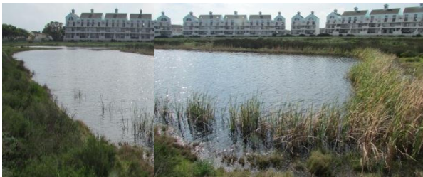
Figure 10: Fixed point photography of the Dam, taken on 18 August.