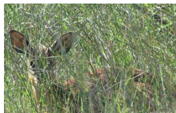
Figure 7: Cape Grysbok