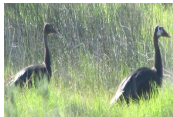
Figure 3: Spur-wing geese