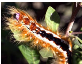
Figure 5: Unidentified caterpillar