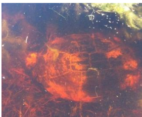
Figure 1: Marsh terrapin

Additional fauna observations for August can be seen below: