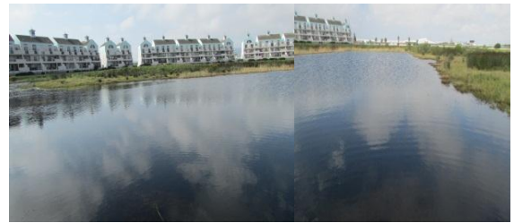
Figure 11: Fixed point photography of the Dam, taken on 18 August.