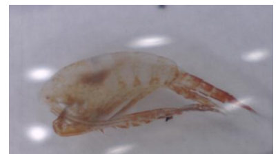
Figure 8: Amphipoda