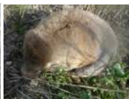
Cape Dune Molerat