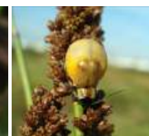
Swollen Restio Beetle