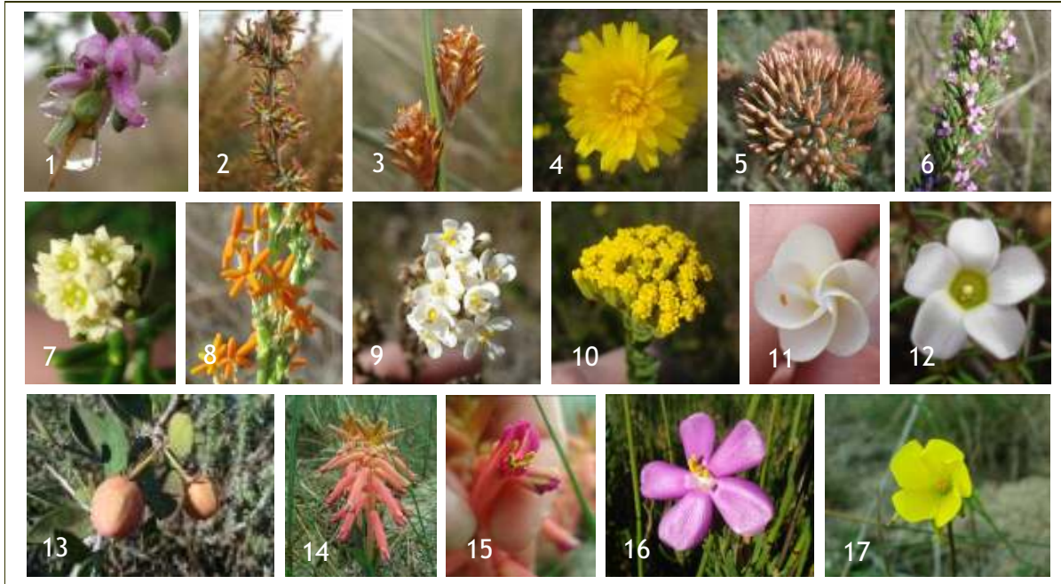
1) Muraltia spinosa , 2) Seriphium plumosum , 3) unidentified restio , 4) Hypochaeris radicata , 5) Metalasia muricata , 6) Muraltia satureioides , 7) Thesium sp, 8) Manulea rubra , 9) CF Selago sp , 10) Athanasia dentate , 11) Oxalis hirta var. tenuicaulis , 12) Oxalis pusilla , 13) Putterlickia pyracantha , 14) Lachenalia punctata , 15) Lachenalia punctata , 16) Orphium frutescens , 17) Oxalis pes caprae .

✕ Quarterly fixed point vegetation photography will be undertaken in June.