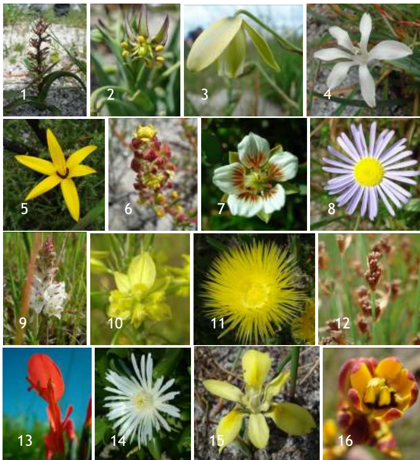
1) Wurmbea spicata , 2) Ornithoglossum viride 3) Albuca canadensis , 4) Babiana tubiflora , 5) Spiloxene caniculata , 6) Tetragonia fruticosa , 7) Zygophyllum sessilifolium , 8) Felicia tenella , 9) Lachenalia contaminata , 10) Bulbine anua , 11) Conicosia pugioniformis , 12) Elegia rectum , 13) Gladiolus cunonius , 14) Disphyma crassifolium , 15) Morea sp, 16) CF Baeometra uniflora