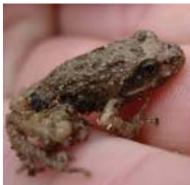
CF Clicking Stream Frog