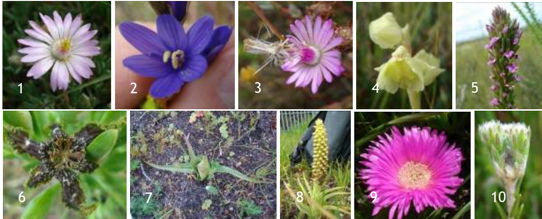
1) Lampranthus sociorum , 2) Geissorhiza juncea , 3) Lampranthus calcaratus , 4) Unidentified, 5) Muraltia satureioides , 6) Ferraria sp, 7) Colchicum eucomoides , 8) Unidentified sp, 9) Carpobrotus acinaciformis , 10) Phylca sp

✕ Some species observed during this month in the southern area.