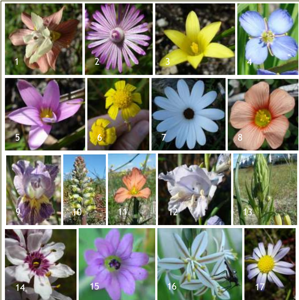
1) Moraea gawleri , 2) Ruschia macowanii , 3) Romulea flava var. flava , 4) Heliophila africana , 5) Romulea rosea var. rosea , 6) CF Senecio littoreus , 7) Dimorphotheca pluvialis , 8) Oxalis obtusa , 9) Gladiolus carinatus , 10) Lachenalia longibracteata , 11) Moraea flaccida , 12) Gladiolus gracilis , 13) CF Ornithogalum imbricatum , 14) Wurmbea stricta , 15) CF Erodium moschatum , 16) Trachyandra CF tabularis , 17) CF Felecia tanella