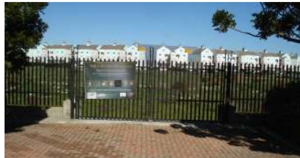
4. Northern entrance