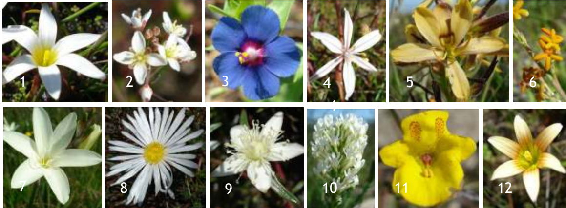
1) CF Romula flava , 2) Heliophila scoparia var scoparia , 3) CF Fumeria muralis , 4) CF Ornithogalum hispidum , 5) Wachendorfia paniculata , 6) Manulea rubra , 7) CF Sparaxis sp , 8) Lampranthus reptans , 9) CF Acrosanthes sp , 10) Dischisma ciliatum , 11) Hemimeris racemosa , 12) CF Romula obscura

✘ Some species observed during this month in the southern area.