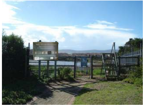
3. Palisade fence in Stable Yard